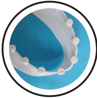
Beads Zipper 7.5mm