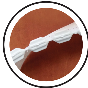
Bullets Zipper 11mm