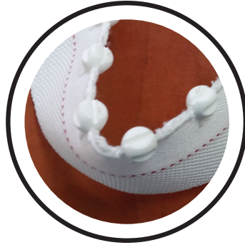
Beads Zipper 9mm